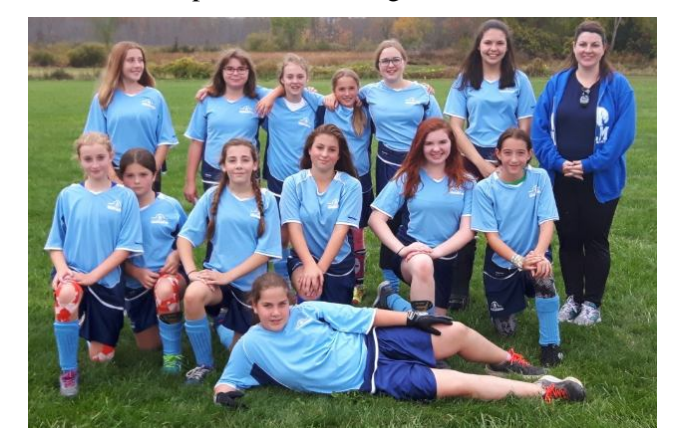
Senior Girls' Soccer

Permission slips will be coming home soon.